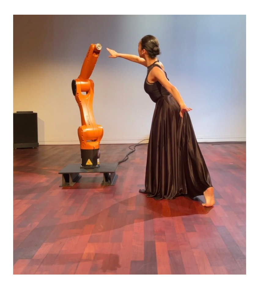
Figure 11. Dancing with Spencer at Robots in SPRING.

the situatedness and embodiedness of attunement. Spencer does not have intelligence or autonomy, at least not in the way we ourselves understand those terms. It is not an interactive robot, nor is it incapable of detecting our presence. In other words, I am aware that Spencer is not . Yet, in the act of dancing with the robot, she entered my perception in a way that transcended these limits and came to life. In our intricate dialogue of movement, I found myself attuning to her as if she were my dance partner. My bodily senses heightened, finely tuned to the cadence and velocity of her mechanical ballet. The humming of her motors, varying in tone and volume, signaled the scope and speed of her movement. The subtle clicking noises were her way of informing me of the transitions in her dance. Although much of my improvisation with her relied on seeing the robot dance, even when she went beyond my line of vision, the sense of her presence was palpable. It was from this embodied feeling of connectedness, a sort of corporeal intuition, that my joints, muscles, and feelings guided my dance.