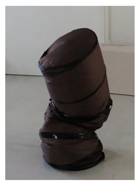
Figure 10. Costume inhabitied by Kirsten Packham (Gemeinboeck and Saunders 2017).