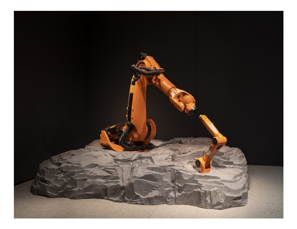
Figure 6. "Mother and Child" by Bram Ellens. Part of the exhibition Imagine Intuition, at Musuem De Lakenhal, Leiden, Netherladnds. 14 October 2023 – 15 January 2024. Image owned by Bram Ellens.

We make sense of others' actions based on the context from which a given interaction emerges. In other words, shared meaning is not created upon an understanding or experience of others' internal states, but through our ability to assume meaning based on how we perceive a certain situation and by projecting that upon the other's actions. A similar principle applies to how we perceive movements of more-than-human others as actions.