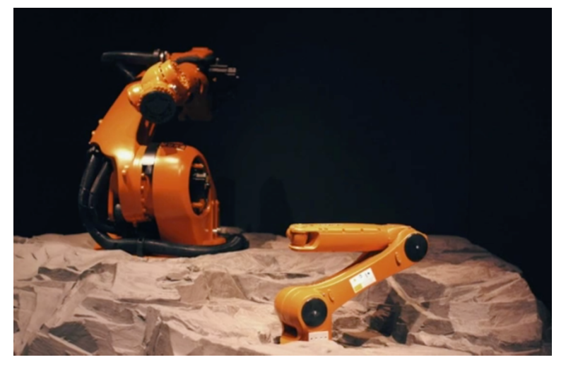
Figure 8. Spencer, 'sleeping'. "Mother and Child" by Bram Ellens (2022).

In "Mother and Child" there was a sequence of movements that Bram Ellens often refers to as 'sleeping'. This movement consists of the robot folding its body, collapsed low, perhaps best described as a cat or a snake that coils up its body to keep itself warm – but somehow different. The robot's body gently and slowly moves up and