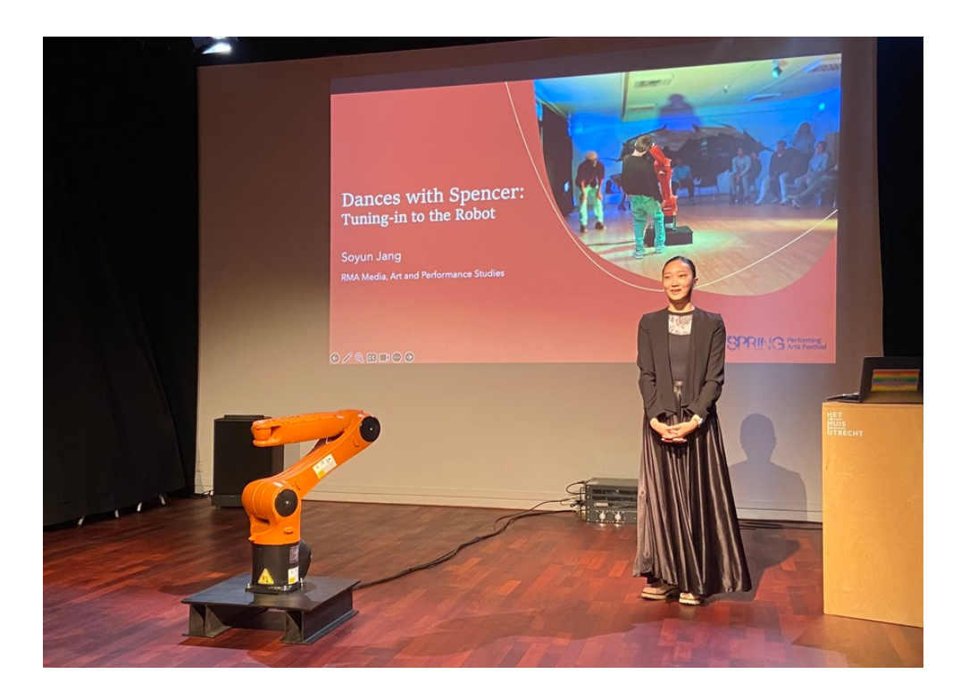
Figure 4. Spencer at Robots in SPRING.

Spencer cannot be easily transported from one point to another due to her weight and requirement for stability, she was placed in the middle of the stage area during this presentation. For this moment, I had programmed her to perform for the audience as if she was aware of her surroundings. I had intended so that to the audience it looked as if Spencer wakes up to look around the audience, listen to me, become bored, and fell back asleep.