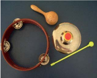
Toy 2: Instruments