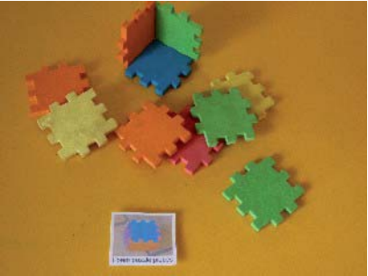
Toy 5: Foam Puzzle