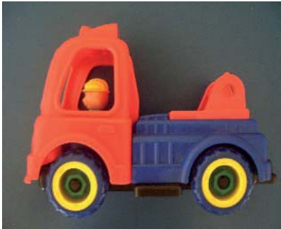
Toy 3: Car