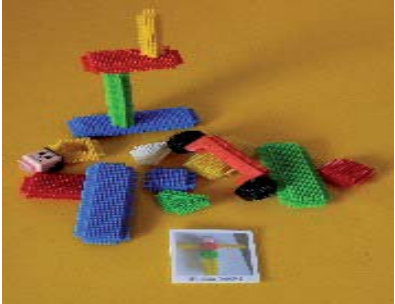
Toy 2: Stickle bricks