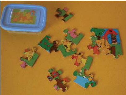
Toy 3: Puzzle