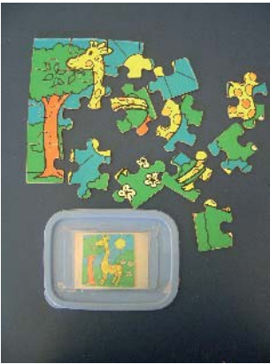
Toy 3: Puzzle