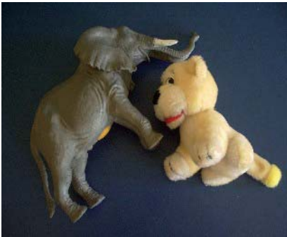
Toy 6: Elephant & lion