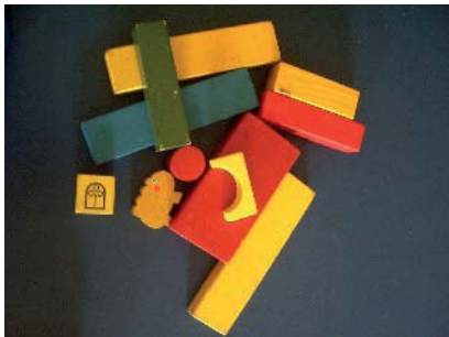
Toy 5: Wooden blocks