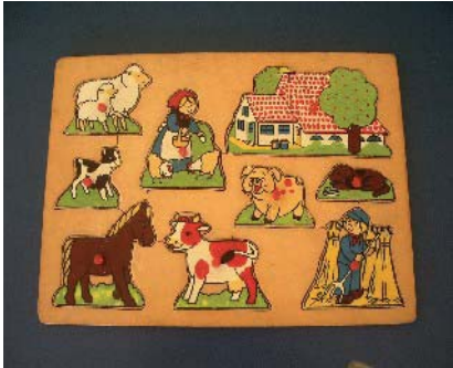
Toy 4: Puzzle