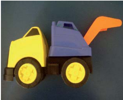
Toy 3: Car