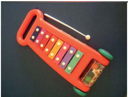
Toy 2: Xylophone instrument