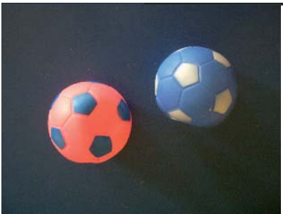
Toy 1: Ball