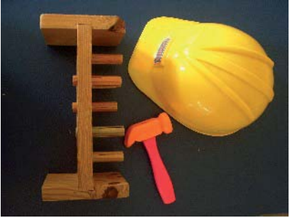
Toy 6: Carpenter tools