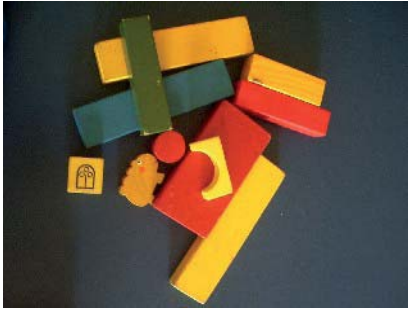
Toy 2: Wooden blocks