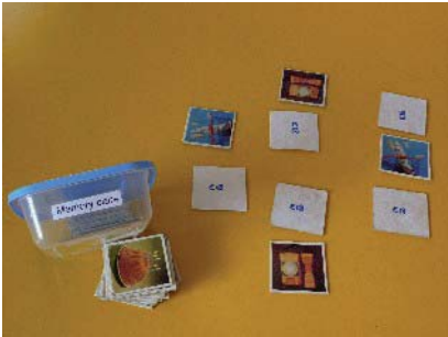
Toy 4: Memory