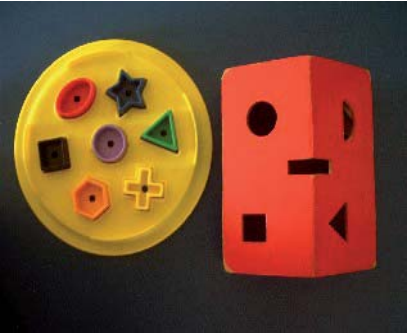
Toy 1: Puzzle box