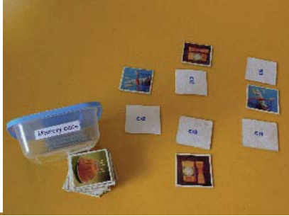
Toy 4: Memory