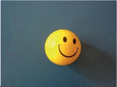
Toy 1: Ball