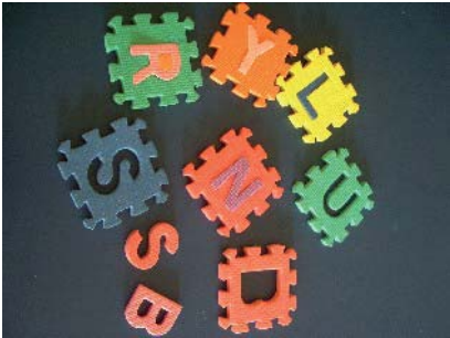
Toy 5: Alphabet puzzle