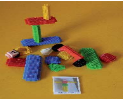
Toy 5: Stickle bricks