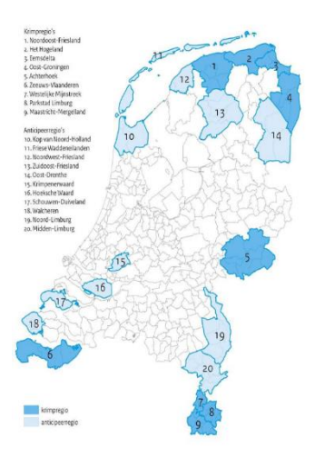
Map 1: Shrinking and potential shrinking areas in the Netherlands (Rijksoverheid, 2023).

To better understand the regions discussed in this research, this chapter will outline some key characteristics of the two regions, starting with Groningen-Drenthe.