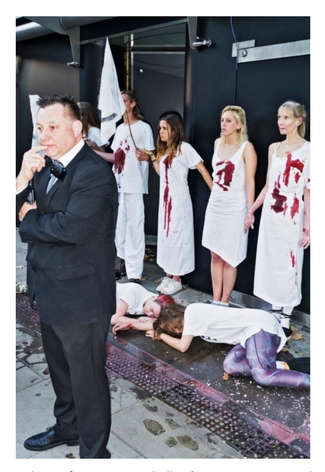
Figure 2. Photo of Extinction Rebellion's openings protest during the London Fashion Week 2019