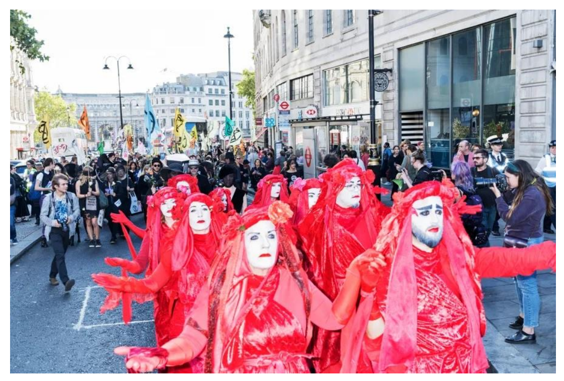
Figure 6. Photo of Extinction Rebellion's closing protest during London Fashion Week 2019