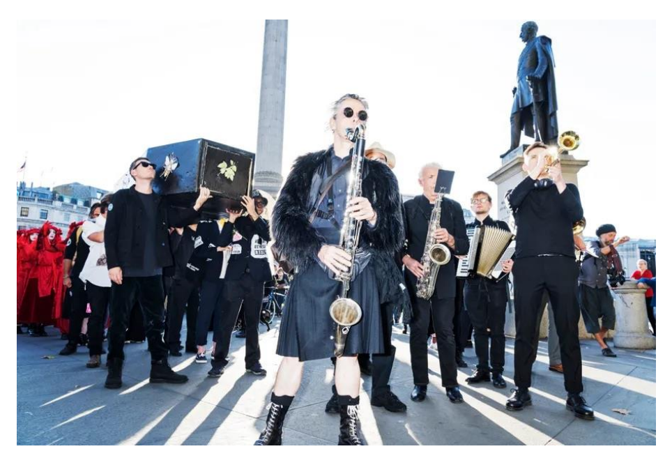
Figure 5. Photo of Extinction Rebellion's closing protest during London Fashion Week 2019

animals and plants, patches representing our Earth. The people dressed in black followed the coffins. It was a funeral procession. Out of the crowd, several light-coloured flags with the symbol of an hourglass stuck out. The symbol of Extinction Rebellion. In front of the fast fashion chain H&M the procession held still. The Red Rebels formed a barrier with their hands up in the air. In front of them, one of the activists held a speech about the environmental consequences of fashion production. A space was reserved for the press in front of her. After the speech, the procession continued towards 180 Strand. Here, they laid down the coffins. The Red Rebels gathered around the coffins and the other artivists created a circle around them. They all put their flowers on the coffins. A few artivists stepped into the circle to give a last reflection on Fashion Week, fashion and climate emergency. Afterwards, everyone sang a song together. They chanted lyrics such as 'people going to rise like the water' and 'climate justice now'. During this song, the Red Rebels performed a funeral ritual around the two coffins. The protest ended with a silence, to pay respect and reflect on the legacy of the fashion industry and the lives already lost due to climate change.