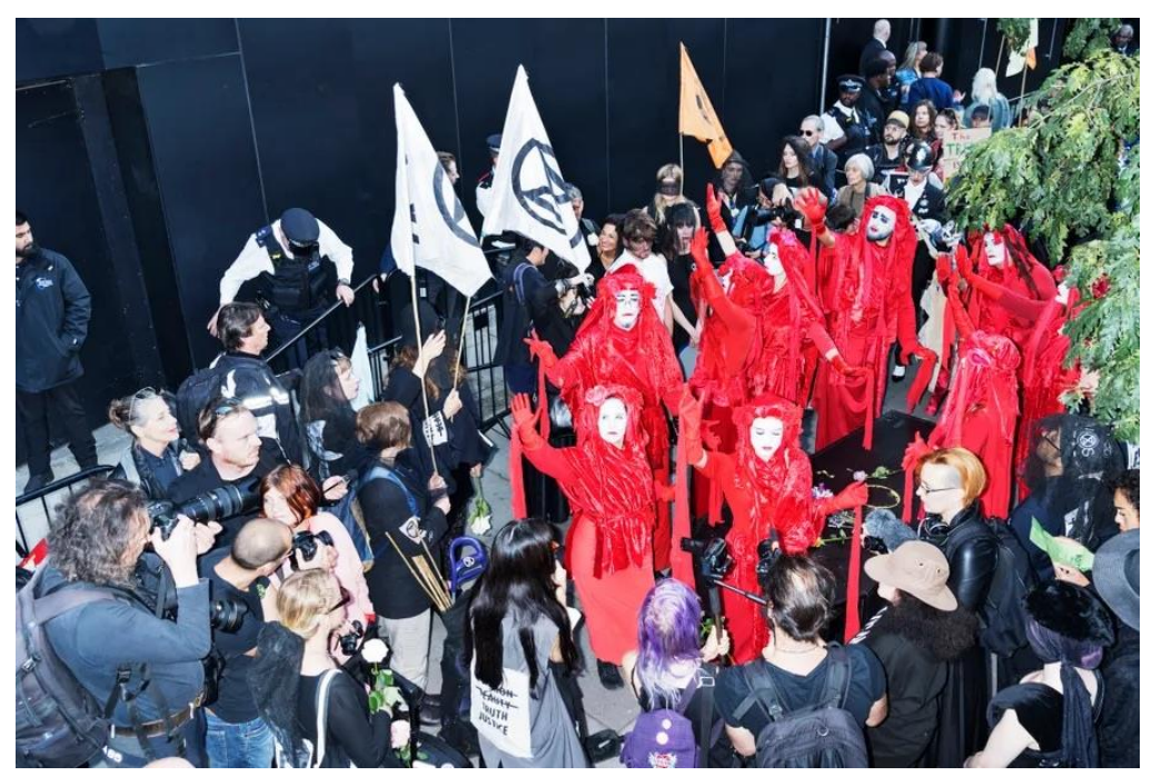
Figure 8. Photo of Extinction Rebellion's closing protest during London Fashion Week 2019

In this opening and closing protest, Extinction Rebellion thus makes use of several artivist strategies and tactics. The artivist tactics of specific aesthetics (through their use of the aesthetics of death), the imagination of other possibilities (through their staged and performed practices) and affect (through their use of artistic practices) are present in these protests. In the following sections of the analysis, I will zoom into how these artivist strategies and tactics, together with more specific strategies and tactics used in performance practices, allow them to express their statement and create an experience for their spectators.