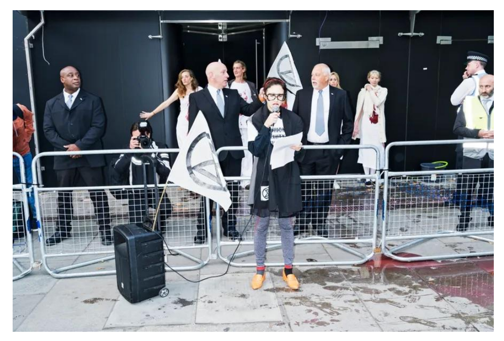
Figure 4. Photo of Extinction Rebellion's openings protest during the London Fashion Week 2019

After a week full of protests to disrupt this edition of London Fashion Week, Extinction Rebellion got ready to end London Fashion Week - forever. At their closing protest on Tuesday 17 September 2019, on the last day of London Fashion Week, around 200 people gathered at Trafalgar Square. Most people wore outfits in all black, creatively put together. Several had covered their faces in veil. Their clothes were pinned with white cloths, proclaiming messages like 'No Fashion on a Dead Planet', 'Fuck Consumerism', 'Fashion Weak', 'Fashion = Ecocide'. Quite a few carried small bouquets of (dried) flowers. After speeches about the fashion industries' carbon footprint, the crowd marched towards 180 Strand (the British Fashion Council building). A black coffin labelled 'R.I.P LFW 1983-2019', lifted by eight rebels in black led the way. They were accompanied by a walking orchestra. Behind this coffin there was a group of people fully dressed in red costumes, only showing their white painted faces. The Red Rebels. They walked in pairs, holding their hands up.