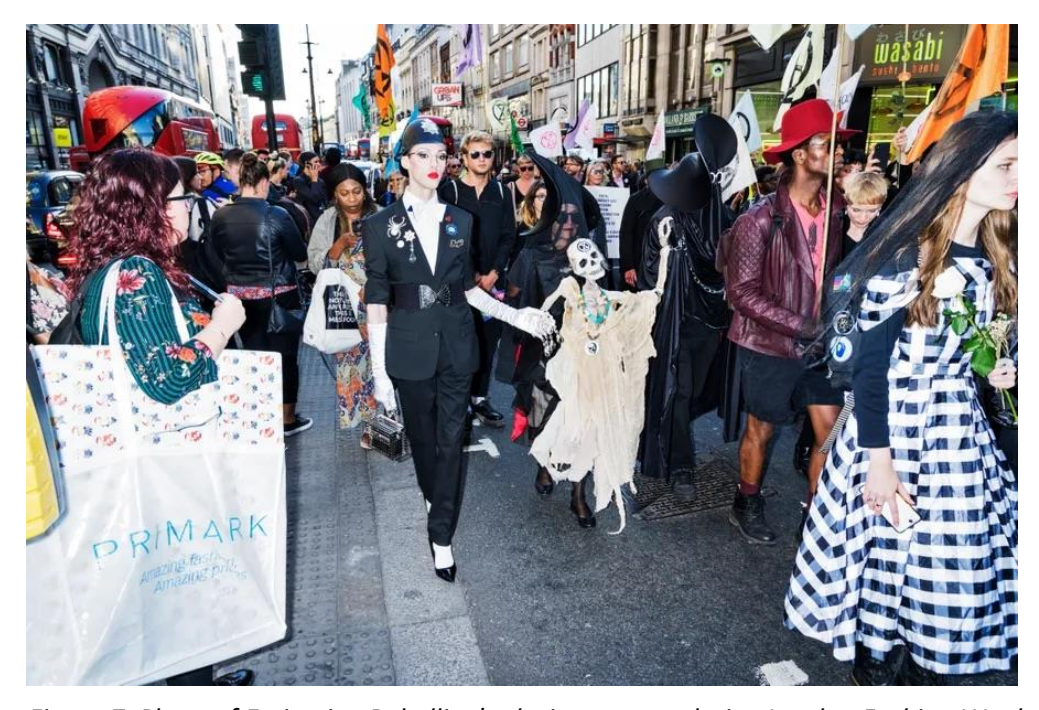
Figure 7. Photo of Extinction Rebellion's closing protest during London Fashion Week 2019