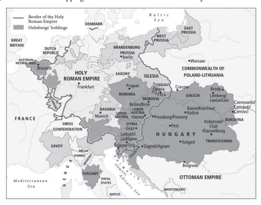
A map of the Habsburg territories at the end of the 18th century.73

The counter-Reformation and the Thirty Year's War quickly extinguished the sparkle of Slovene national consciousness and literacy.71 It would last until the 19th century for the language to take shape and gain acceptance again. It survived through the centuries as a peasant language. In the following centuries, trade with German and Italian lands caused a higher standard of living in Slovenia than in more remote, predominantly agricultural regions of the inner Balkans. This intense economic activity provided for the emergence of a Slovene bourgeoisie with an overlapping German and Slovene cultural identity.72