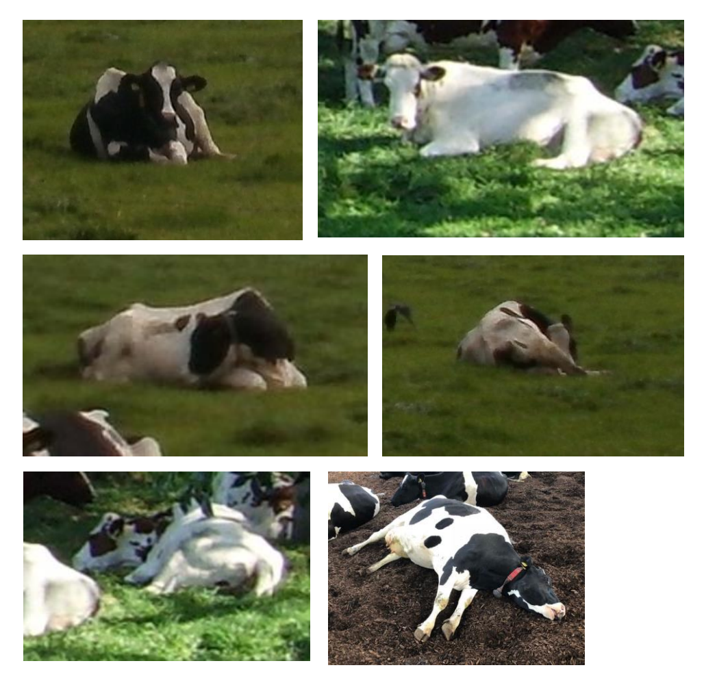
Figure 1. Four different postures of the cow: head up, head back, head on the ground and flat on the ground (Van Eerdenburg, 2020).

The postures of the pairs of cows laying together was recorded. There are four different postures of the cow; head up, head back, head on the ground and flat on the ground, as shown in Figure 1. (Krohn & Munksgaard, 1993). 'Head up' was defined as the cow is lying on her sternum, with her head raised high. 'Head back' was defined as when the cow is lying on her sternum, and her head is turned towards her flank. 'Head on the ground' was defined as the cow is lying with a stretched neck and her head is lying on the ground in line with her body. And 'flat on ground' was defined as the cow lying flat on her side, with her head on the ground. Nine possible combinations of the postures were possible in a pair of cows. These combination were recorded as head up – head up (1), head up – head back (2), head up – head on ground (3), head back – head on ground (4), head back – head back (5), head on ground – head on ground (6), head up – flat on side (7), head back – flat on side (8) and head on ground – flat on side (9).