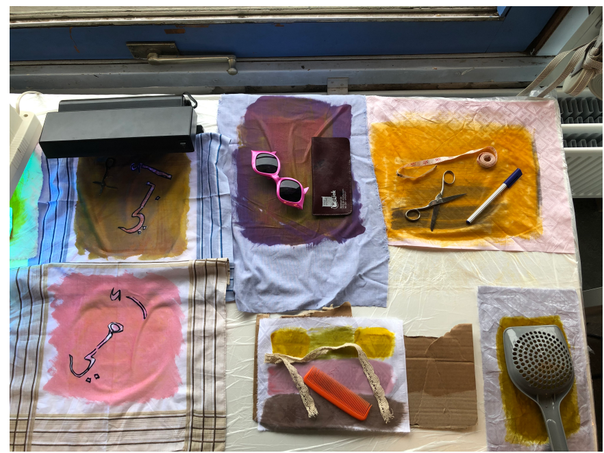
Images captured during one of the workshops by Hanna Miletć, demonstrating the technique of sun printing.