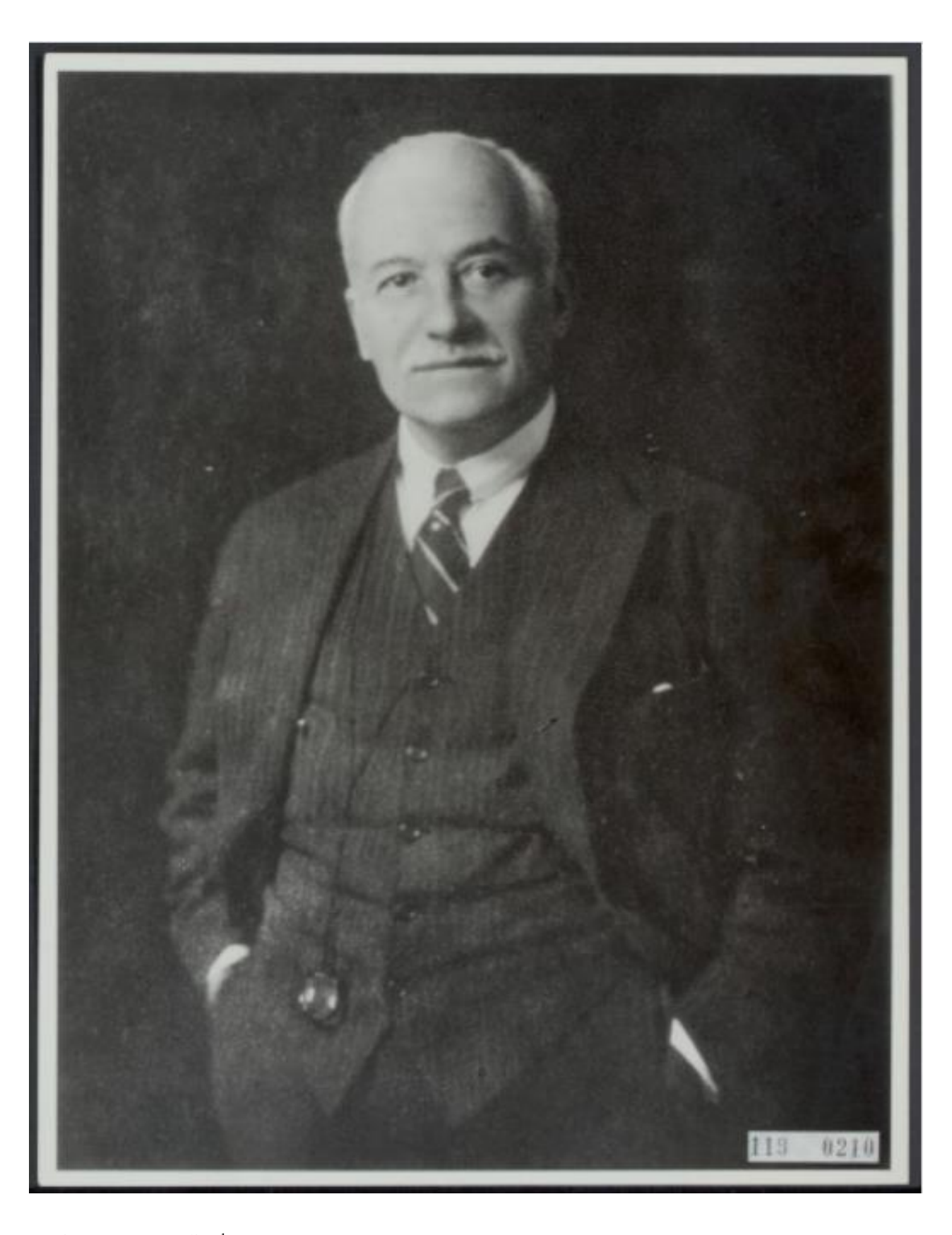
Sir Henry Deterding<sup>1</sup>

^{\rm 1} Nationaal Archief, The Hague (hereafter NL-HaNa), 'Photo Collection Henry Deterding', catalogue number: 2.24.10.02, inventory number: 119-0210. (Date unknown)