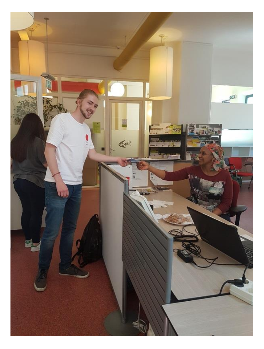
(Receiving my own Makkies for helping at Vonk)

These first additions to the Makkies system accepted individual Makkies as a form of payment, the local bike shop for example accepted 20 Makkies for a second-hand bike worth 75 euros. A haircut could be scheduled at the hairdresser for 2 Makkies. These newest additions to the Makkies system were businesses often only accepted the Makkie-coupons, some new additions included stores such as the Balkonie (a fashionable plant store), Stov (a luxury gift shop), Licht & Meubel (a high end furniture store), Jansen Vintage (a second-hand furniture store). Other more common additions included smaller cafes or stores.