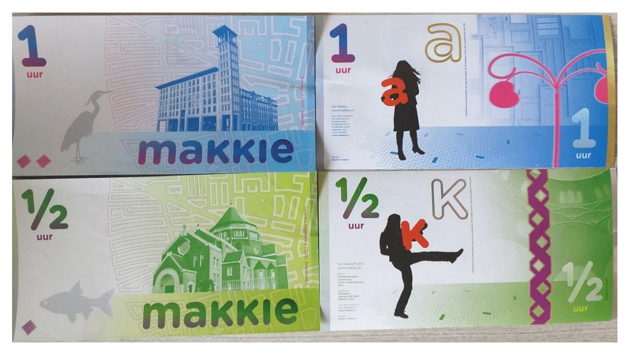
(Makkies 1 Hour bill and ½ Hour bill)

Makkies aims to promote social cohesion among community members by stimulating them to engage with each other. Community members of Amsterdam Oost were initially encouraged to exchange Makkies amongst themselves for simple services and tasks. Or by spending Makkies on activities together. More recently goals include fostering local economic development, by introducing new spending points for Makkies such as at small locally owned businesses or other businesses willing to accept Makkies as a form of payment. The Makkies ecosystem mainly grows by adding more social organizations that work with volunteers. Nowadays new businesses join through the introduction of the Makkie-coupon.