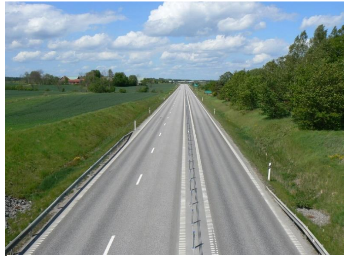
Figure 1 A 2+1 road in Sweden

The first one relates to vehicle speed that is inherently safe to the system, as proposed with the new motorized speed limit system. This is often realized with the median barrier or the 2+1 road, this barrier is now a standard design on new roads where speeds are over 70km/h. The barrier is erected in the middle of a 2+1 road, meaning that is has two alternating lanes on one side and one on the other. This wired barrier prevents that a head-