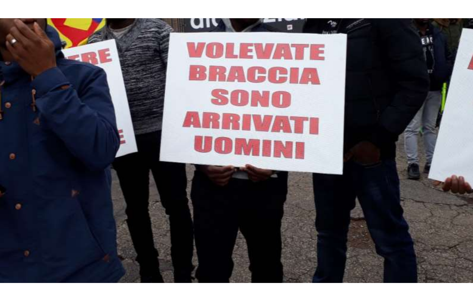
"you wanted labour force, yet received people"

The production of '(il)legality' through the construction of frames and narratives in Naples and Caserta