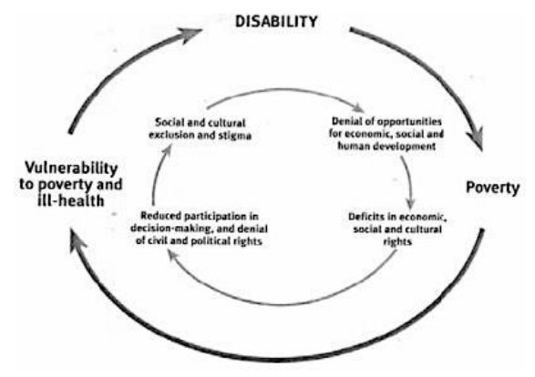
Figure 1. The circle of disability and poverty.

growth. Disability and poverty are strongly related in low- and middle-income countries (Mitra, Posarac, & Vick, 2013), and seen as a vicious circle (Yeo, 2005), see figure 1. That is, there is a greater representation of disabled persons among the poorest, which leads to social stigma (Global Campaign for Education, 2013). This leads to lack of access to services, such as education or health care. Lack of education limits opportunities to escape poverty (e.g. through employment) (Filmer 2008; Mitra et al., 2013). This exclusion leads to deepening of poverty and will be passed onto the next generation.