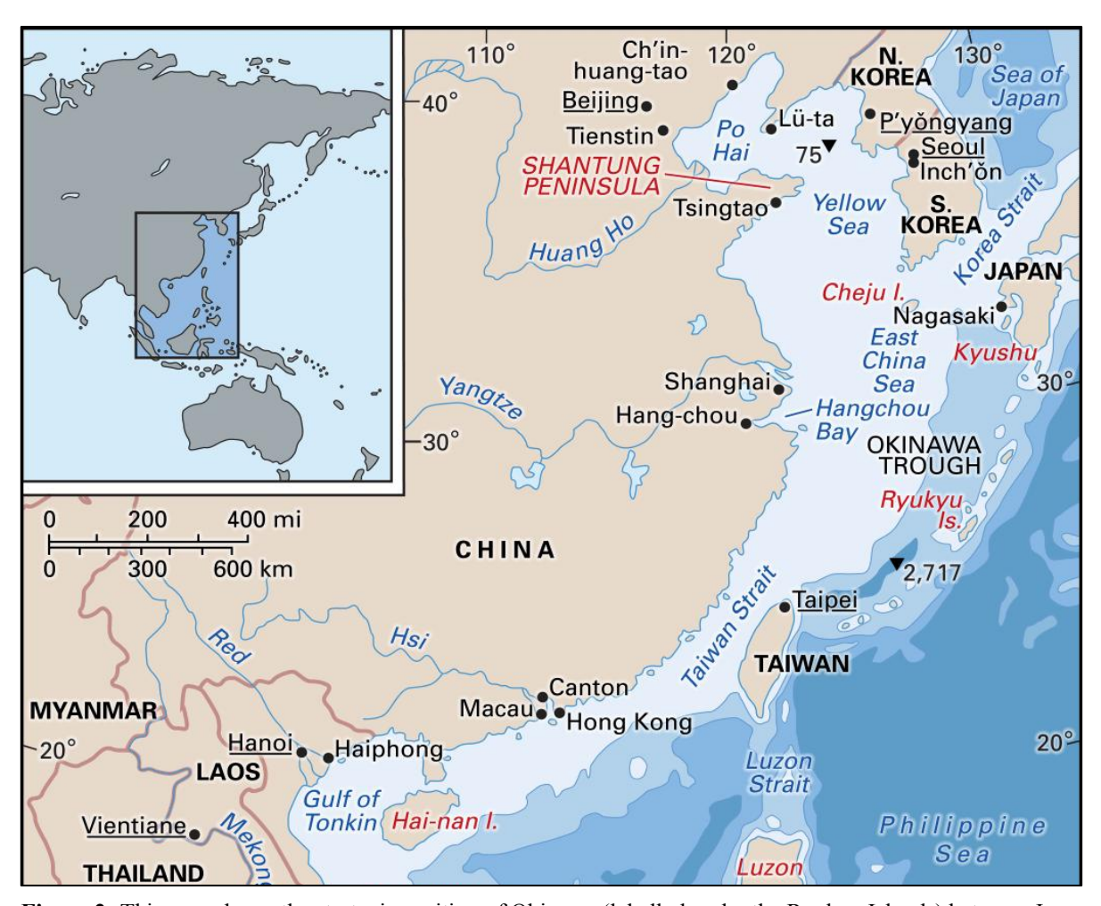
Figure 2: This map shows the strategic position of Okinawa (labelled under the Ryukyu Islands) between Japan, China, Taiwan and the Korean Peninsula.

The starting point for this study is 1995, when the targeted, and well-organised, activism of OWAAMV created a crisis in the US-Japan security alliance. This, in turn, led to significant changes in the US approach to Okinawa.<sup>35</sup> The situation in 1995, and anti-base protest in Okinawa, has, however, been explored in some depth before. Therefore, it is important to first briefly outline the existing historiography on this topic, to highlight the analytical space in which this study situates itself. The methodological approach to the sources will then be elaborated upon, before the focus on feminist-based protests through the lens of human security theory is finally explained.