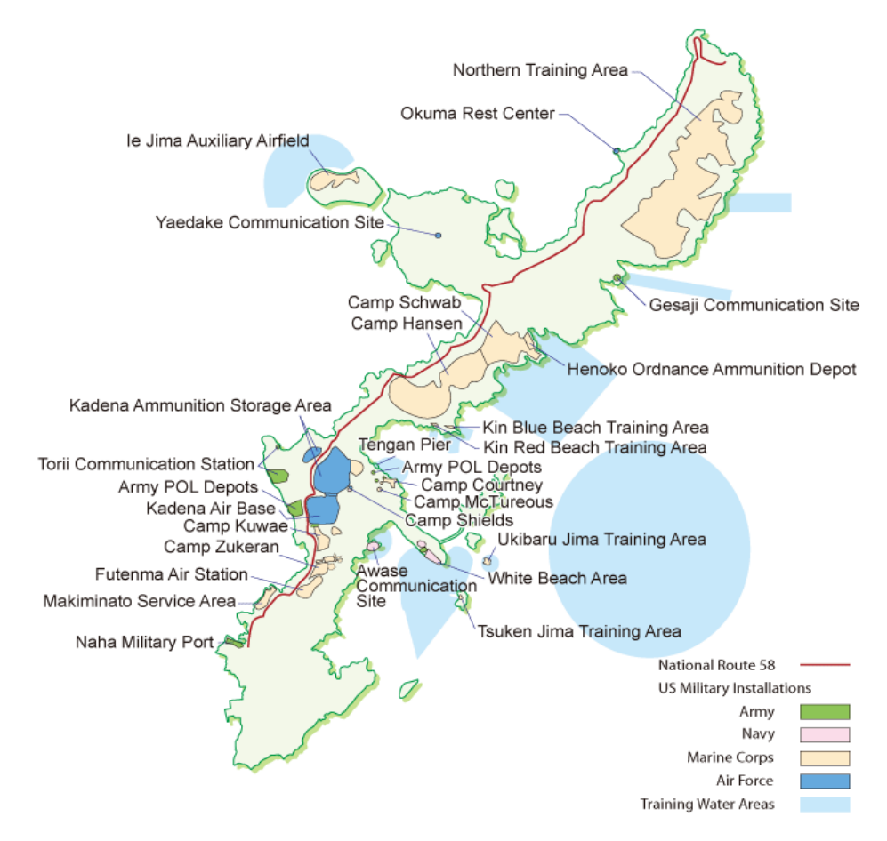
Figure 4: A map of the US bases, installations and facilities in Okinawa, correct as of April 2018. Futenma is located towards the bottom left, in a particularly congested area, whereas the proposed Henoko Bay facility would be further North and form part of Camp Schwab.