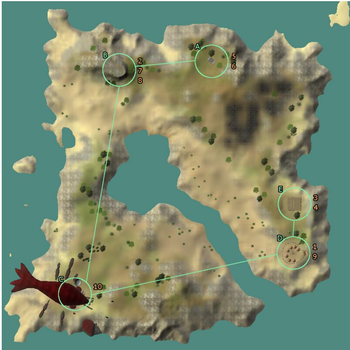
Figure 5: Scenario 2 Path and Questions