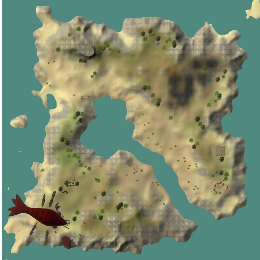
Figure 1: Map of Omosa

The island has 6 virtual characters on it, participants can engage in conversation with the characters, who give them facts about the island and the whereabouts of other characters. The conversations are in the form of multiple choices for the participant. A number of conversation options are given to the participants, one of which ends the conversation, the other options have one response from the virtual character after which the original choices appear again. At the start of the interaction with the virtual environment, the participants were given instruction how to play the game through dialogue with the first character they meet.