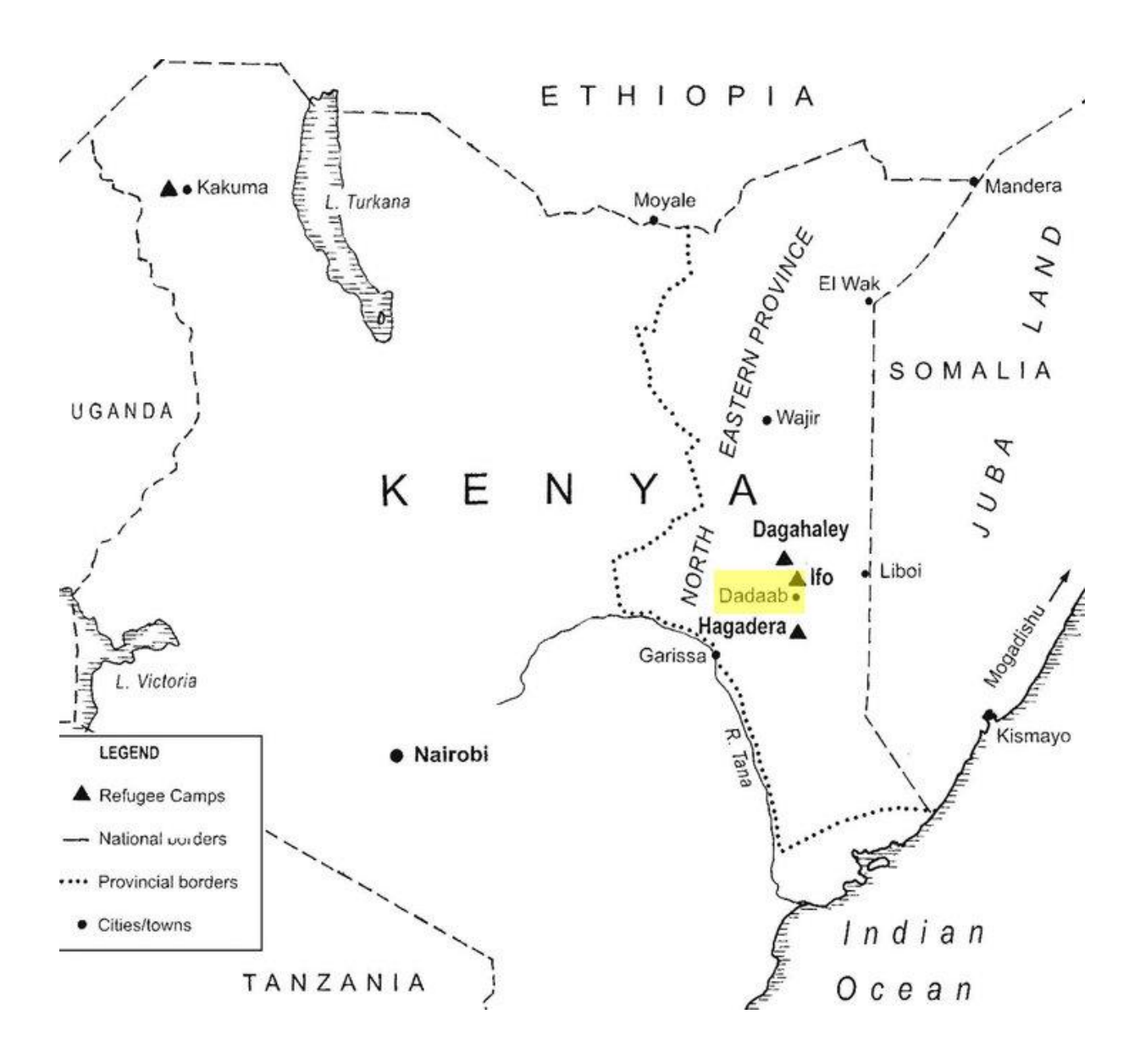
Figure 1: Map of Kenya, indicating the location of Dadaab refugee camp (Rawlence 2016).