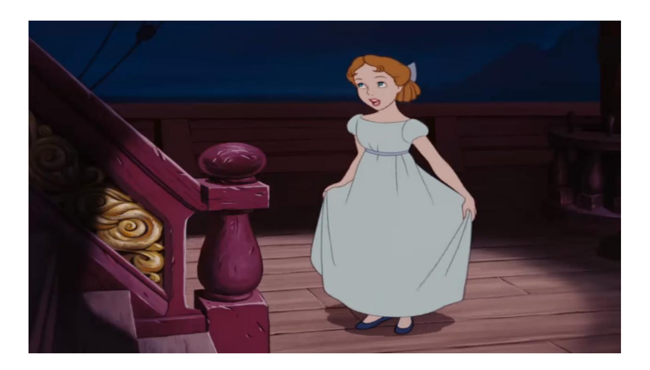
Figure 1.2. Wendy in the 1953 film adaptation.