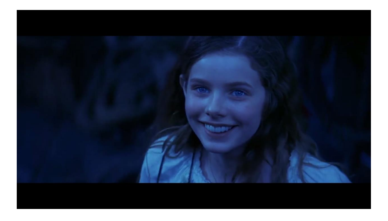
Figure 2.1. Wendy (Rachel Hurd-Wood) in the 2003 film adaptation.