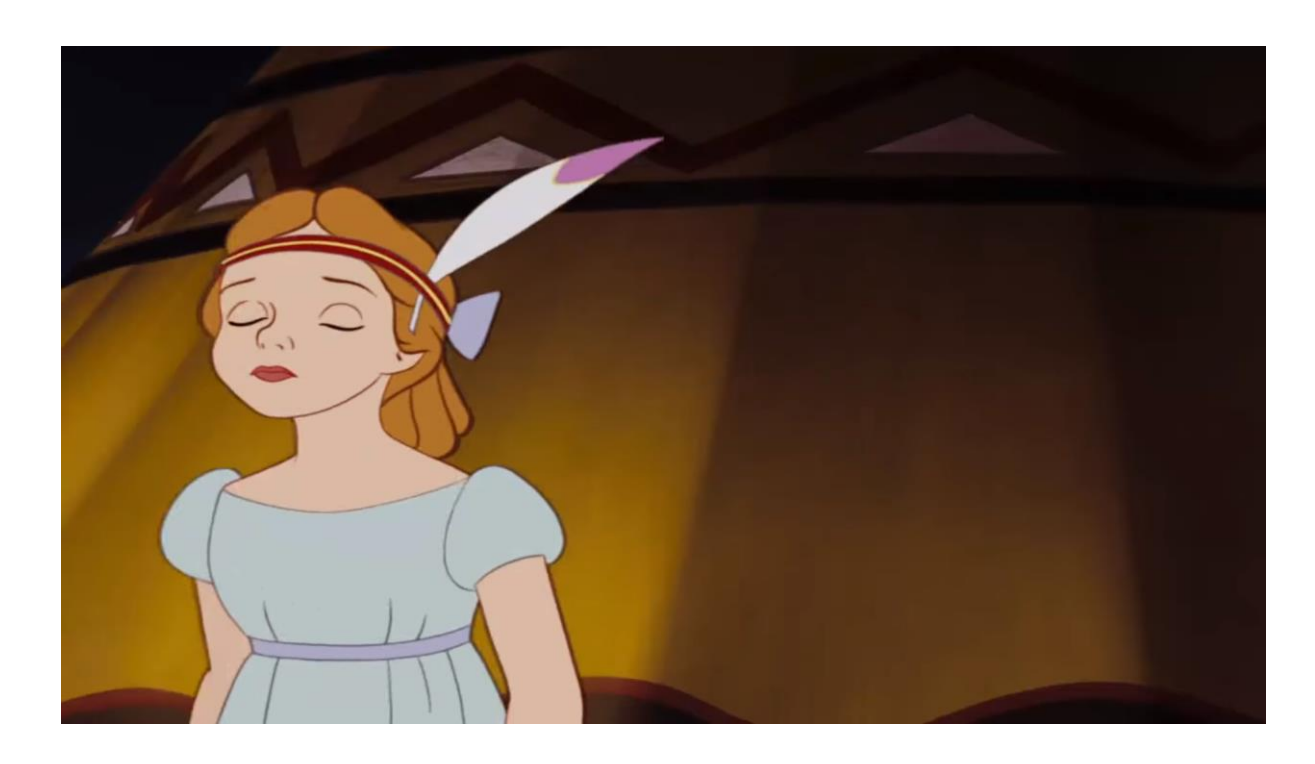
Figure 1.1. Wendy puts her nose in the air and refuses to carry the firewood.