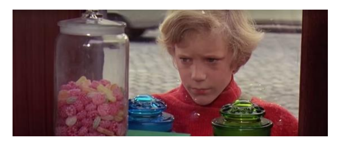
Charlie Bucket (Stuart 5:23)