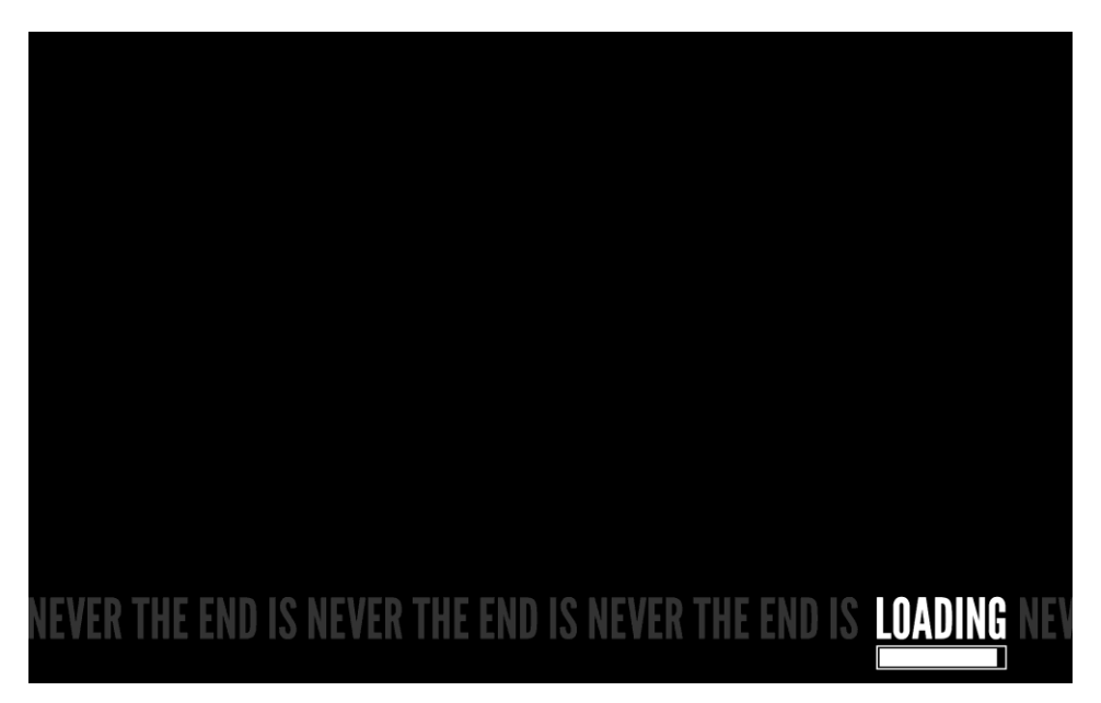
Figure 6: The loading screen in The Stanley Parable