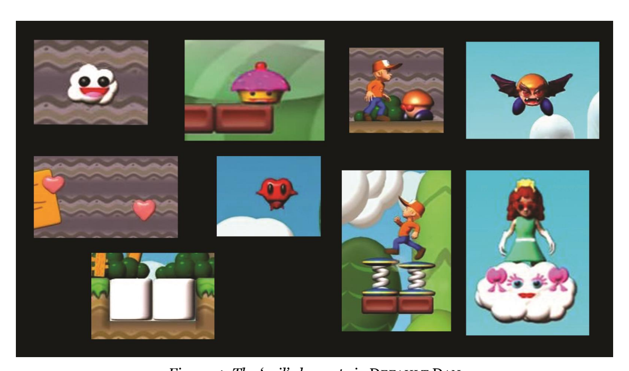
Figure 4: The 'evil' elements in Default Dan

The category score embodies every component in DEFAULT DAN that influences the calculated score at the end of every level. When the player finishes a level, a scoreboard appears. The player's score depends on the amount of trophies collected, times died and time needed to complete the level. But to get a score and finish a level, there are elements that can influence it and also go against the initial habituation of the player. Firstly, there is a distinction between 'good' and 'evil'. Since the player can't judge these elements by how they look, they are put into this category because of their functions. The 'evil' summons the things that are there to counteract or halt the player from advancing in the game. The 'good' summarizes things that help the player in the game or are just there. Things that can be classified in Default dan as 'evil' are: the seemingly happy critters, certain platforms, hearts, the princess and her cloud, springs and jumping hearts. All of these elements are depicted in Figure 4.