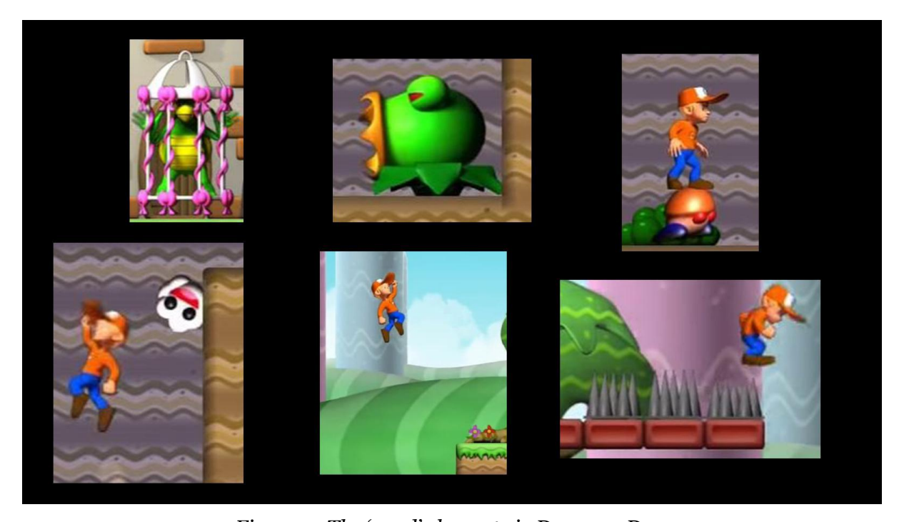
Figure 5: The 'good' elements in Default Dan

Making contact with some beings will kill Dan and make his body separate in several pieces that explode and fly around the level. Whereas, other procedural rhetorical elements don't kill but halt the player and inflict the score. The 'good' elements are depicted in Figure 5. This category entails the friendly turtle, the carnivorous plants, cliffs, spikes and the actions of standing on top of a critter or attacking it from below. All of these elements benefit the player when encountering them and help the player get a better score at the end of the level.