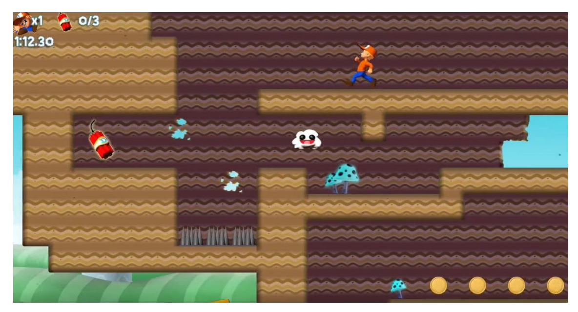
Figure 2: A screenshot from the game DEFAULT DAN

and hearts are negative and can kill the player. Whereas the elements that are negative in conventional games, are positive in Default Dan: enemies and hazards help the player out in this game. The player has to collect dangerous objects, as bombs, and avoid smiling clouds, as seen in Figure 2.