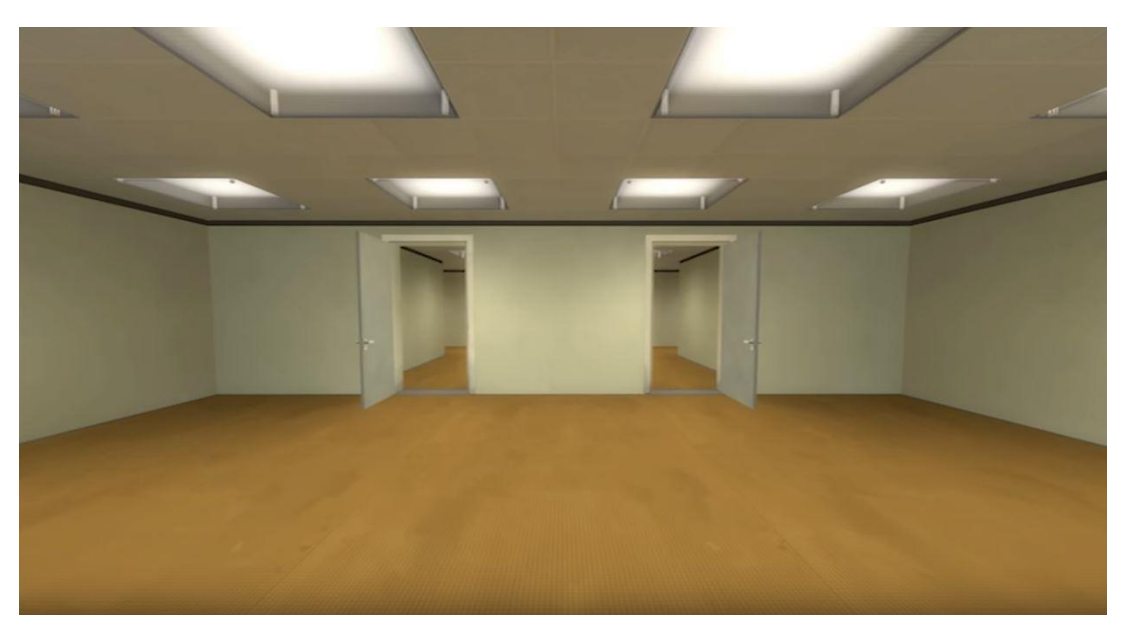
Figure 3: A screenshot from the game THE STANLEY PARABLE

story that has no end. You will play a game that you cannot win".<sup>48</sup> In an interview with Wired magazine, Wreden was asked about the design ethos for THE STANLEY PARABLE and he said: "I wanted this to be a kind of slap to the face [to video game developers]".<sup>49</sup> For that reason, the video game has been studied in several researches.<sup>50</sup> These investigate how the game is about games themselves, self-awareness of the player, the agency of the play, etcetera.<sup>51</sup> <sup>52</sup> The game goes against conventions and is therefore a prime example of rejecting habituation.