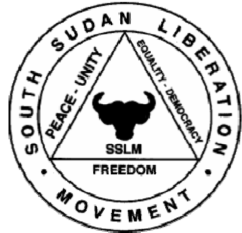
Figure 2: Symbol of the SSLM ( http://en.wikipedia.org/wiki/South_Sudan_Liberation_Movement )

liberation for the people of South Sudan from the yoke of Arab domination and oppression”, that was to be accomplished by conflict resolution through a negotiated settlement and through armed struggle (SSLM Press Release 2000: 1). In April 2011, the SSLM was brought back to life by Peter Gatdet, who had just defected from the SPLM/A (Sudan Tribune 13 November 2011). There is not much known about the activities of the SSLM between 2000 and 2011, but in the first years of the new millennium they have released some press statements, which speak of attacks by the SPLA on the SSLM/A (1 February 2000, 6 July 2001, Common Sense #1 January 2002, 11 March 2002). On 11 April 2011 the Mayom Declaration was released, that states the objectives that the SSLM/A is currently intending to achieve which will be discussed later on.