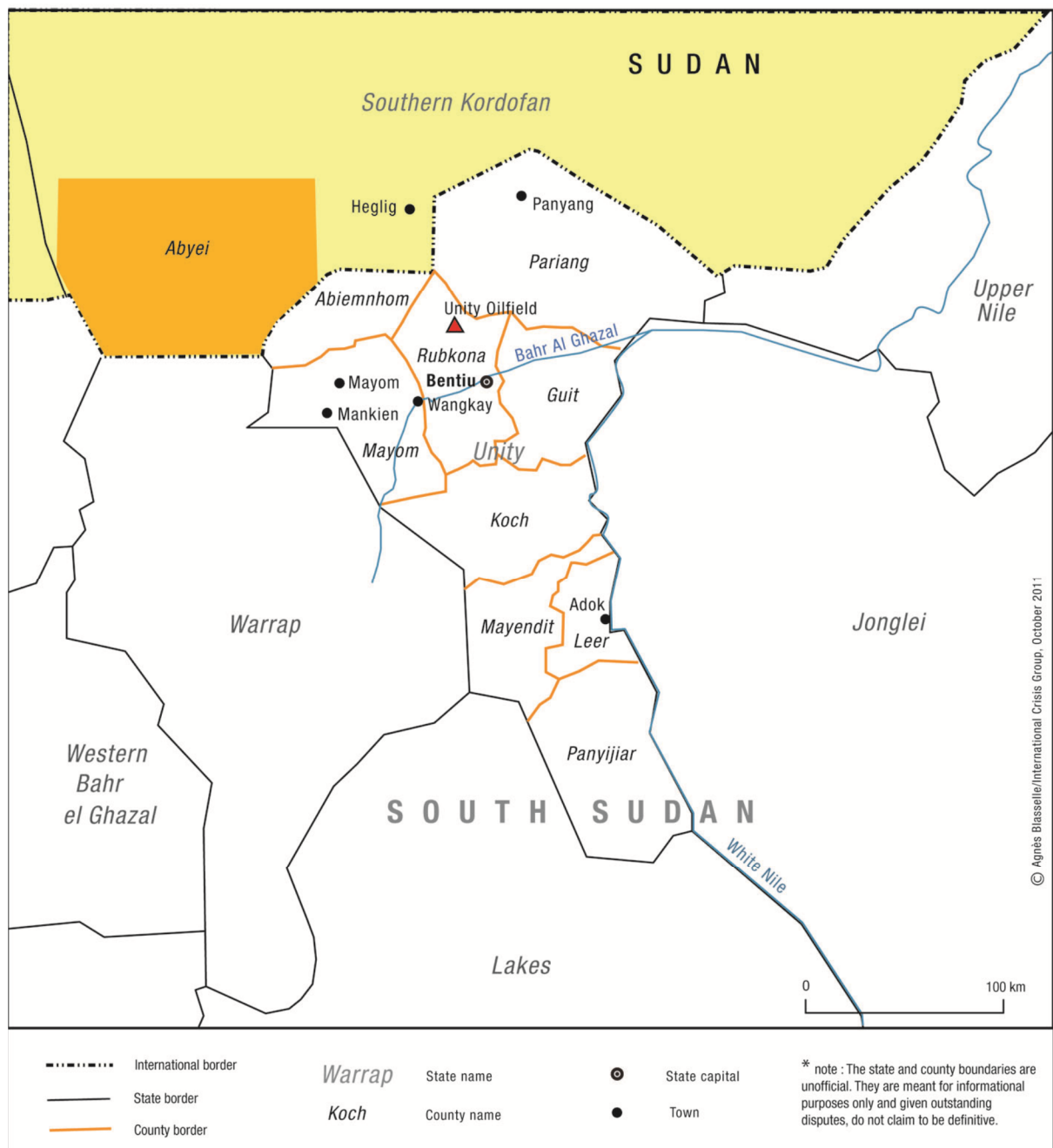
Source: International Crisis Group Report 'Compounding Instability in Unity State'. Map by Agnes Blasselle, October 2011.