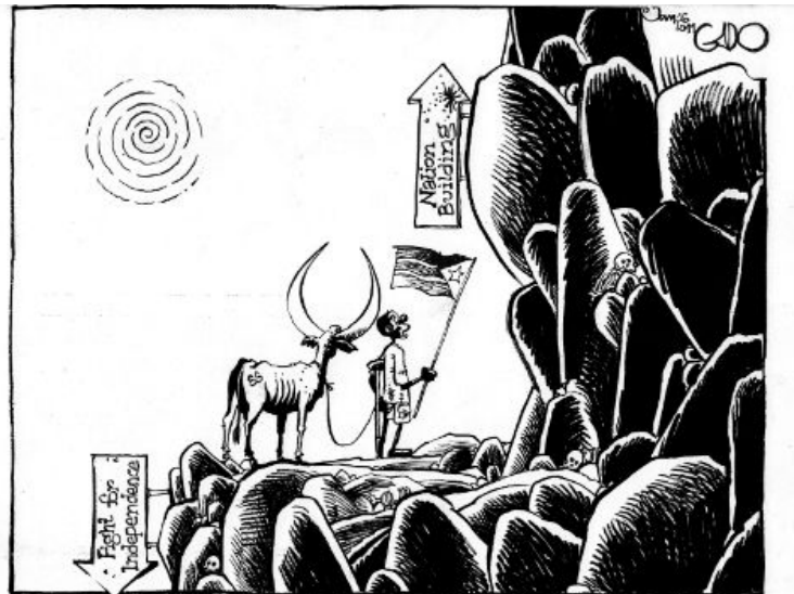
Figure 1: cartoon by GADO, 7 July 2011 ( http://pambazuka.org )

The International Crisis Group (2011) identified two factors that can shape the transition period: the degree to which the SPLM allows an opening of political space; and the will to undertake democratic reform within the SPLM. The first great challenge for the Republic of South Sudan has been to establish a