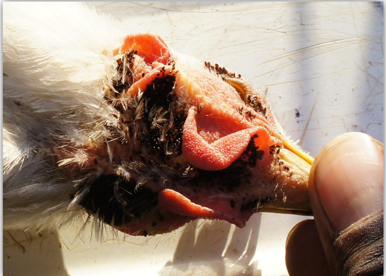
Figure 1 Heavy infestation with Echinophaga gallinacea on a chicken in Athol village, South Africa