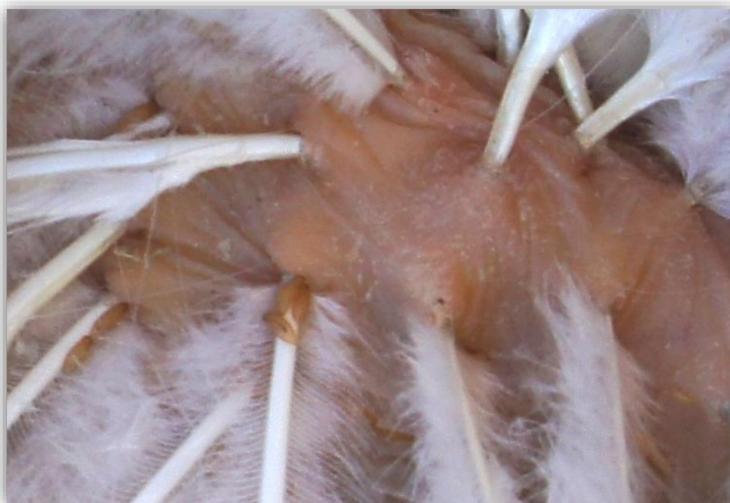
Figure 2 Lice on feather shafts of chicken in the Mnisi area