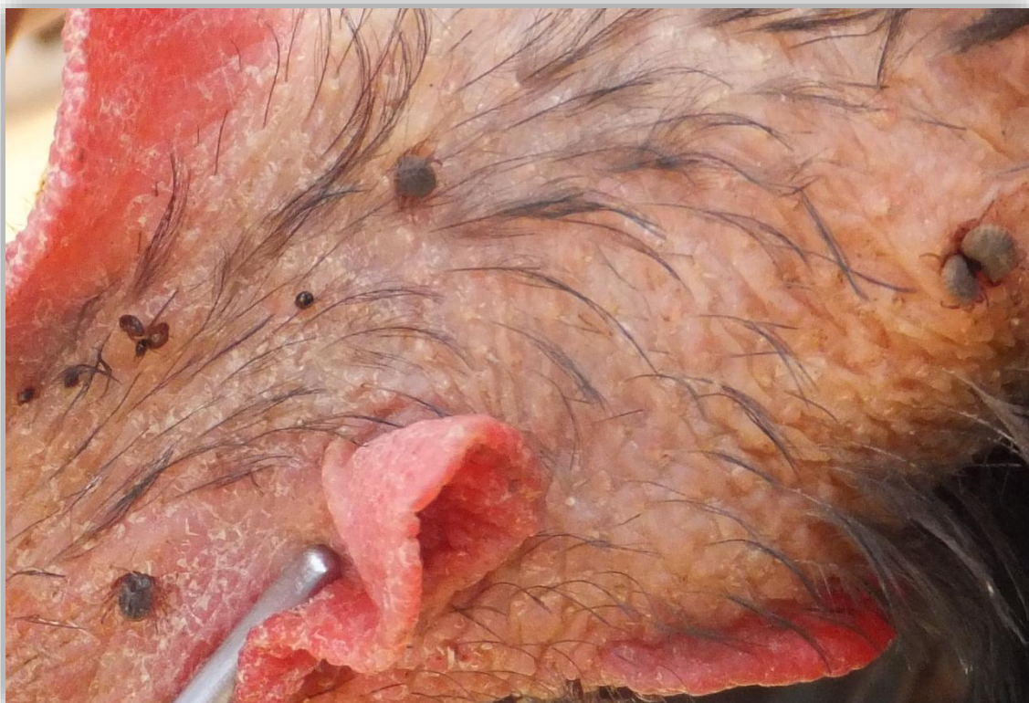
Figure 3 Chicken with Echidnophaga gallinacea and Amblyomma hebraeum infestation on chin and neck in Hluvukani village, South Africa

Ticks (only immature stadia) are found on chickens in 11 of the 13 villages (85%). No adult ticks were collected and none of the investigated flocks bore any signs of a tick infestation. Infestation per chicken ranged from one to dozens of ticks. The highest amount of ticks in one household is found in Thlavekisa; 183 ticks are found on only six chickens. The two tick species found are Amblyomma hebraeum (11 villages) and Haemaphysalis elliptica (only found in one household in Shorty village). The ticks are mostly found on the head and the neck (figure 3). One Amblyomma hebraeum tick is found in the cloaca of a chicken in Dixie village (figure 4).