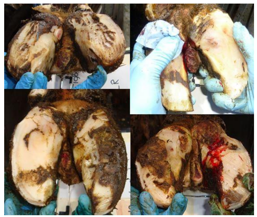
Figure 5: Combined interdigital hyperplasia and digital dermatitis as seen in this research, showing digital dermatitis lesions (stage M2) on interdigital hyperplasia