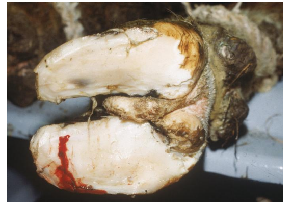
Figure 2: An example of interdigital hyperplasia (9), the typical mass can be seen between the digits

Interdigital hyperplasia is a proliferative reaction of the digital skin (8). Interdigital hyperplasia is characterized by a fold of fibrous tissue hanging down into the interdigital space (7). Figure 2 clearly shows the mass in the interdigital space, a typical sign of interdigital hyperplasia.