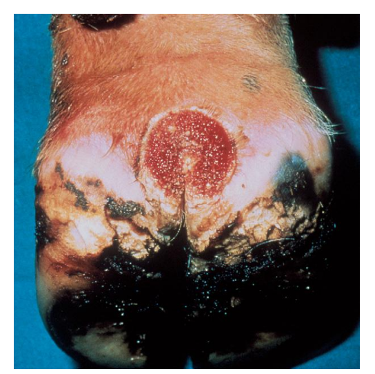
Figure 3: Typical digital dermatitis lesion, showing a strawberry-like lesion surrounded by a white circle (7)

Digital dermatitis is an acute inflammation of the hairy skin of the bovine foot. The disease is thought to be caused by spirochetes, as these microorganisms are commonly isolated from the lesions (7). More specifically, Treponema spirochetes are thought to be causative agents. The disease is present all over the world in housed cattle (3). Hind legs are more often affected than front legs (9). The lesions are commonly seen at the plantar side of the claw, near or in the interdigital space. Heifers seem to be the most affected age group (3) and it is especially seen in early lactation (4). Risk factors for digital dermatitis are large herds, acquisition of new animals and wet housing conditions (4). Figure 3 shows the most typical appearance of the disease: the ulcerative M2 stage (12).