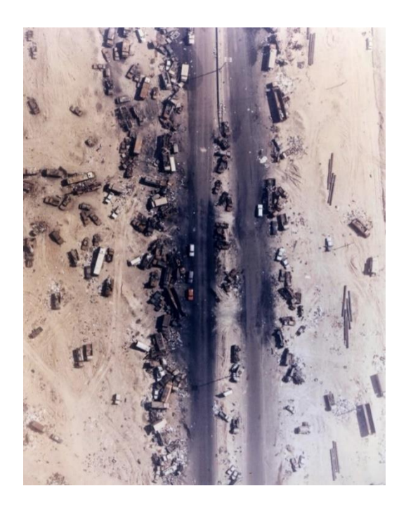
Figure 2 The result of Allied air bombing on retreating Iraqi troops, Kuwait 1991. ^{102}