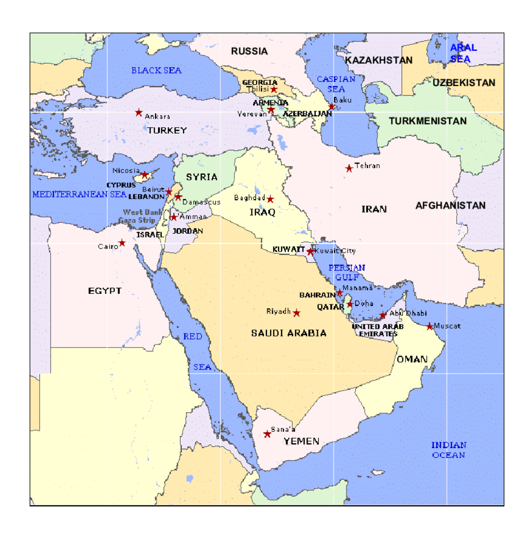
Figure 1 Map of the Persian Gulf region.<sup>53</sup>