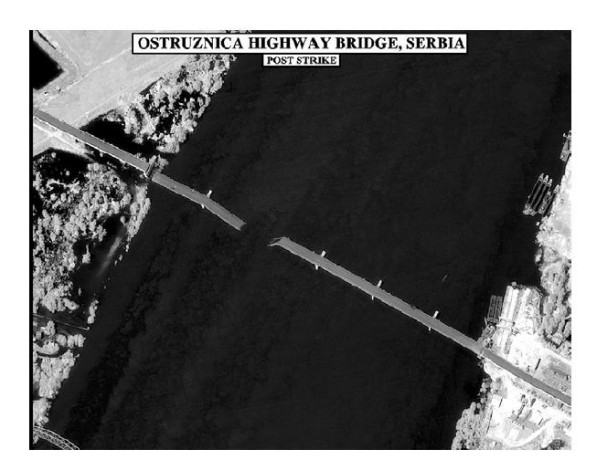
Figure 5 Damaged bridge in Serbia after a NATO attack.<sup>200</sup>

Professor of Law Ved Nanda argues that Operation Allied Force became a US showpiece and that NATO's mission was 'flamed from the outset.' <sup>197</sup> NATO thought that the threat of an air war would be enough to make Milosevic back down. The contrary happened. From the moment the NATO mission started, Milosevic intensified the ethnic cleansing in Kosovo. <sup>198</sup> Infrastructure was destroyed, villages were burned, thousands of Kosovars were murdered and over 800.000 Albanians fled Kosovo, which led to a refugee crisis in Europe. <sup>199</sup> NATO had to continue its air war and figures 5 and 6 are photos of destroyed infrastructure caused by NATO attacks against Serbia.