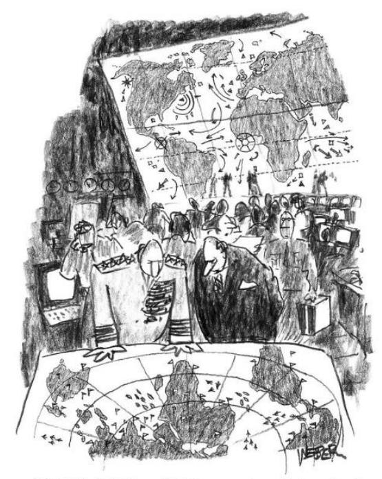
"World War III? Hmm. O.K., but , remember, nobody gets burt."

In bypassing the UNSC and using a disproportional amount of airpower, NATO's mission in Kosovo was focused on its personal power position in the world and staying in control. When referring to Martin Shaw's concept of the new Western way of war, it can be said that Operation Allied Force was focused on reducing their own 'risk' and minimizing 'casualties' to keep public support for the war.<sup>209</sup> The cartoon in figure 7 illustrates a NATO's war room in which it was, according to the artist, priority to make sure that no one got hurt.<sup>210</sup>