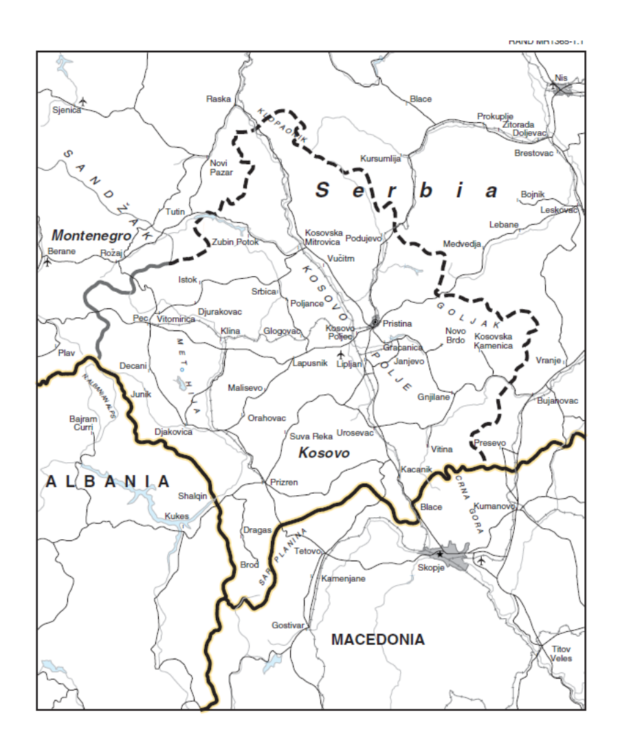
Figure 4 Map of Kosovo.<sup>140</sup>