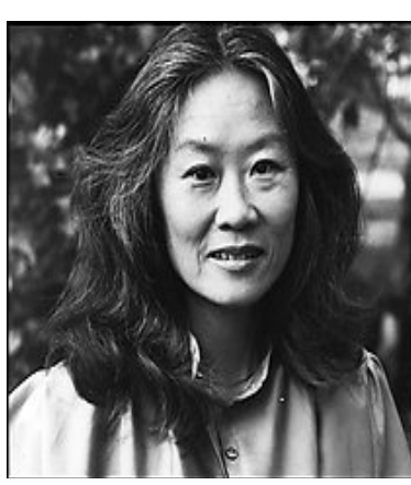
Maxine Hong Kingston